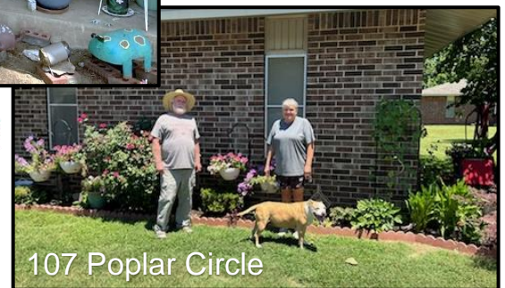
107 Poplar Circle