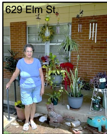
629 Elm St

Yard of the Month Winner – Our judges could not decide on just one favorite, so this time we have TWO winners! Congratulations to 107 Poplar Circle AND 629 Elm Street! You are both Yard of the Month winners!!! Your yards were so nice and neat! Great job!